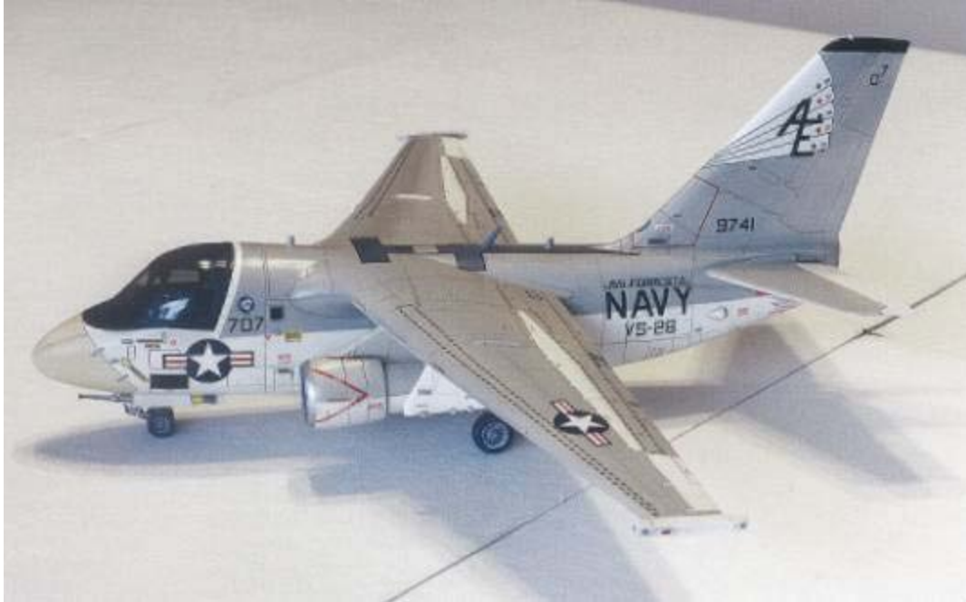
Tom used markings from AM # 48-469 for VS-28.